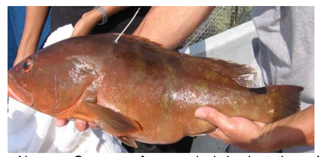
Nassau Grouper after surgical implantation of Vemco V16® acoustic transmitter and spaghetti tag.

Since January 2006 a total of 58 Nassau groupers, 30 females and 24 males, have been fitted with normal, presence-only Additionally, 2 males and 2 transmitters. females were fitted with pressure-sensing transmitters. Fish were caught with the assistance of Mr. Ivan Young (Mr. Phillip) and Mr. Pete Young, lighthouse keepers at Sandbore Caye and traditional fishers of the Nassau arouper spawning aggregation. Increased collaboration with other acoustic studies will ensue to investigate long-range movements of spawning fish.