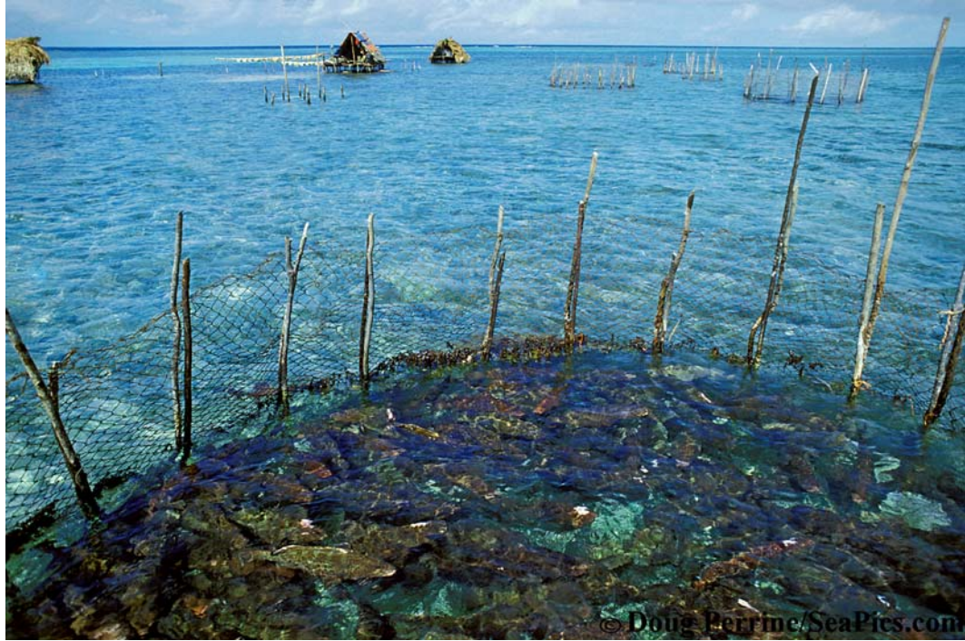
Figure 4: Fish corrals or holding pens built from mangrove stakes and chicken wire used for keeping the Nassau grouper alive.

Fishing at Caye Glory during the Nassau grouper spawning aggregation was hard work (Craig 1966, Carter 1988). The fishing was done in deep water on the outside of the reef. Fish were placed in the dories and “we had a guy there beating them with a stick.” 24 Inside the reef, the fishermen built shacks or camps in which they ate, slept and corned, or salted and dried, their fish. The more prosperous fishermen also had pens, essentially wire cages in 3 or 4 feet of water, in which they kept fish alive and took them to market live. Those with no pens had to corn their fish at the end of each day in order to preserve them, while the others corned only the fish that did not survive to get into the pens. Descriptions of that hard work from the interviewed fishermen again reinforce the picture of bounty, as illustrated by the following comments: