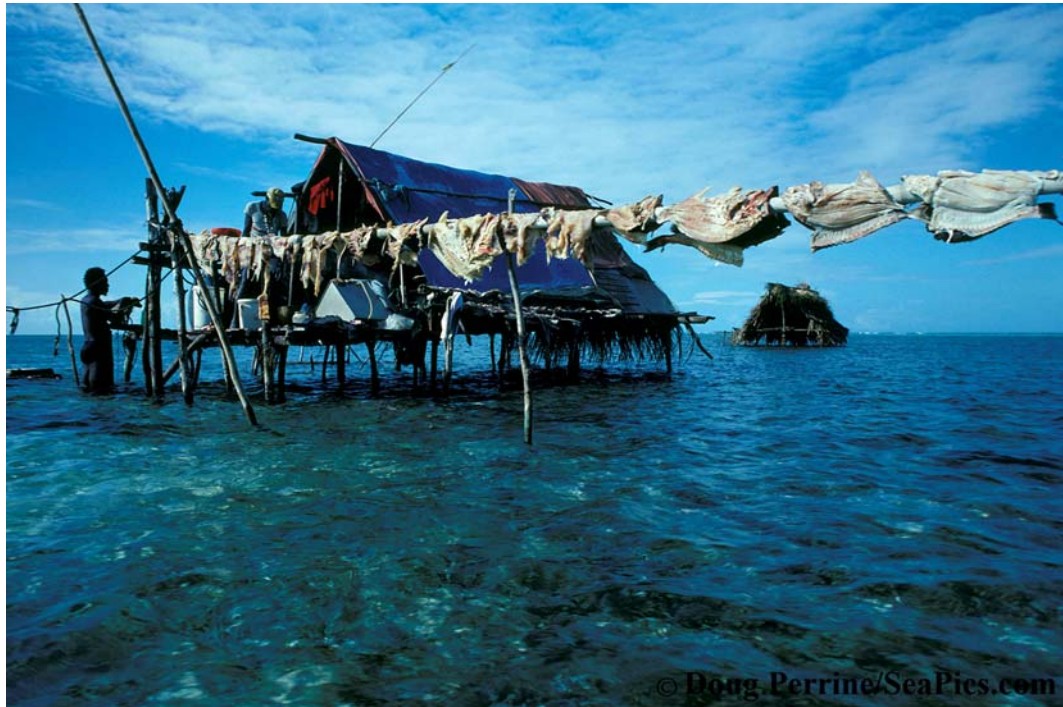
Figure 5: Fish-drying racks (tendedores) at Caye Glory.

The fishermen also salted the roe, although by a slightly different and easier process from that used for the rest of fish. The roe was sold or often used as “rent” for the fences, piers and roofs used to dry grouper. 27