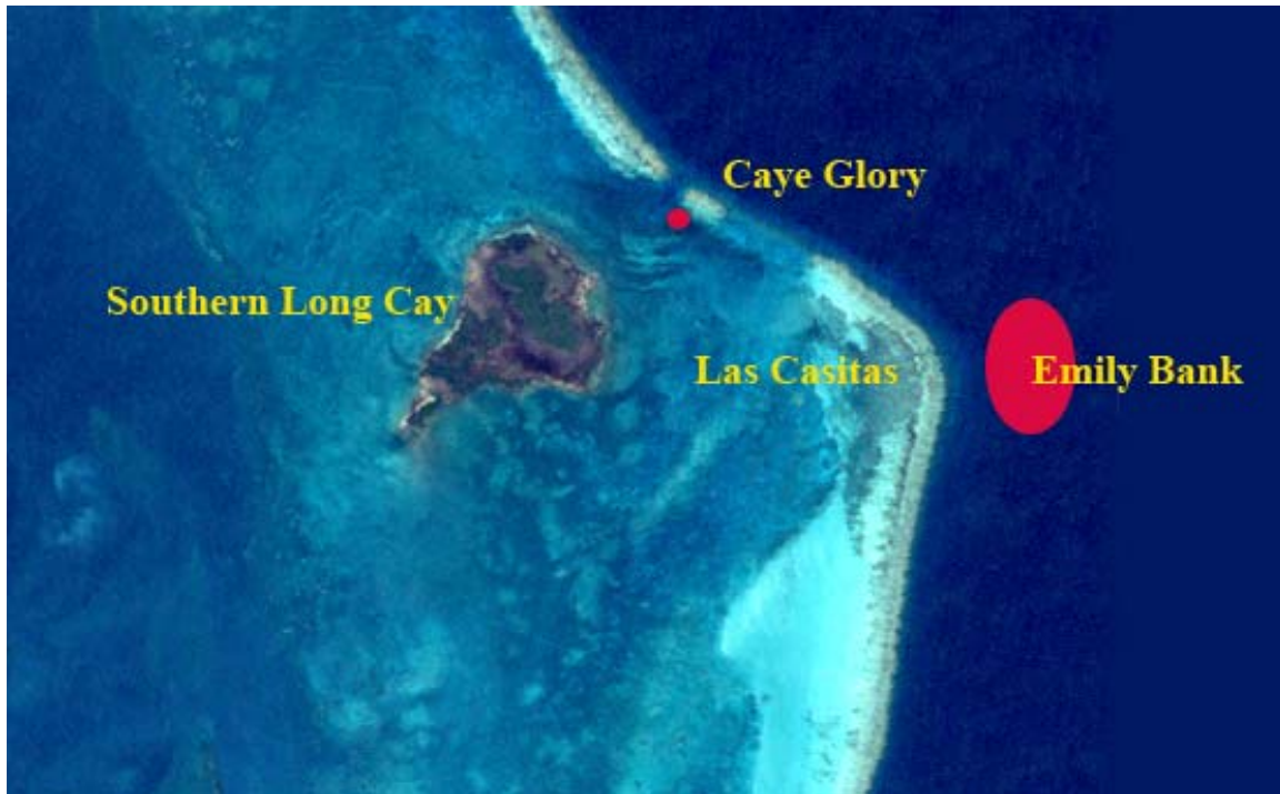
Figure 2: Satellite image of the Caye Glory reef promontory showing location of the former island of Caye Glory, the grouper spawning site and shoal where local fishermen establish themselves temporary camps.