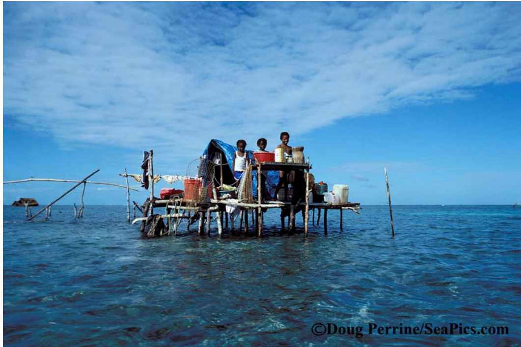
Figure 3: A hut at Caye Glory build on the shoals during the grouper spawning season.

Although the numbers that once typified the aggregation can never be known, the early literature provides an unambiguous albeit unquantified picture. In 1944 the spawning aggregation at Caye Glory was described as follows: