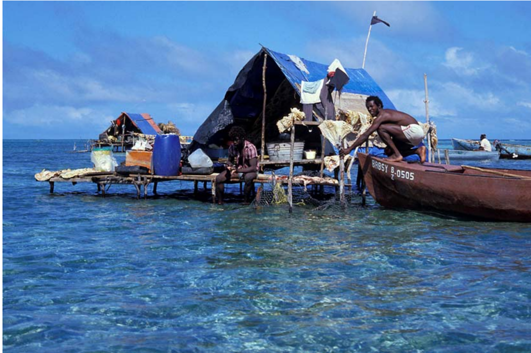
Figure 6: Dugout canoes or dories used to handline for grouper off the Caye Glory spawning site.

longer due to an additional 3-5 days of processing, primarily through drying in the sun (Thompson 1944, Craig 1968, Gordon 1981).